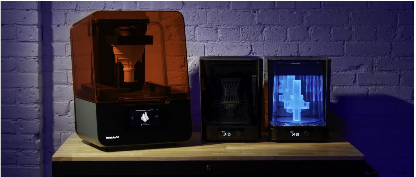
Stereolithography (SLA) technology on FormLabs 3D printer (shown with Form Wash and Form Cure).