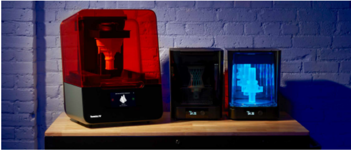
Stereolithography (SLA) technology on FormLabs 3D printer. (shown with Form Wash and Form Cure)